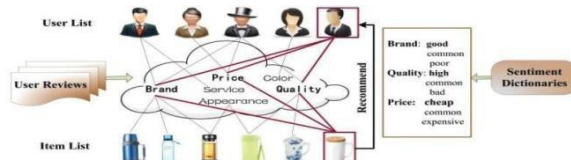
Fig. 1. The product features that user cares about are collected in the cloud including the words "Brand", "Price", and "Quality", etc. By extracting user sentiment words from user reviews, we construct the sentiment dictionaries. And the last user is interested in those product features, so based on the user reviews and the sentiment dictionaries, the last item will be recommended.

edge over their rivals. It can likewise be used as part of a cycle with strong perceptions to enhance the business's competitive edge over its competitors. Feelings may be tracked and analysed. Using introspective investigation, we